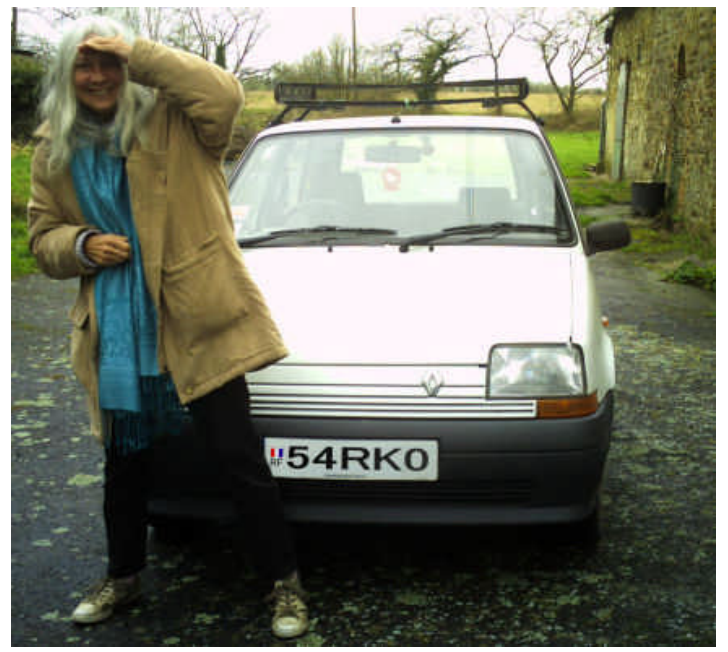
On my 60th birthday proudly wearing the scarf my Australian friend sent

PS - I still haven't learned to do anything with a computer except to plug it in. Oh, well :-) •